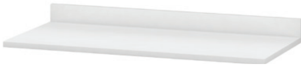
Hospitality Counter Top - 36", 54", 72", 90"W