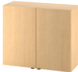
Double Hanging Wall Cabinet - 36"W 2 Doors