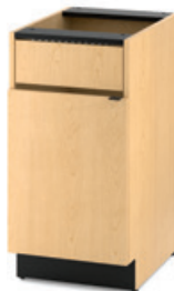
Single Waste Management Cabinet - 18"W 1 Door