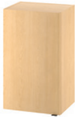
Single Hanging Wall Cabinet - 18"W 1 Door

The modular design of Hospitality Cabinets provides the flexibility to work within your space requirements and achieve the exact functionality you need. It's also made of high-quality materials that will stand the test of time, providing a professional appearance for years to come. The HON Full Lifetime Warranty guarantees that HON Hospitality Cabinets are more than a smart purchase, they are a wise investment.