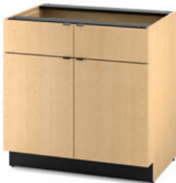
Double Base Cabinet - 36"W 2 Drawers / 2 Doors