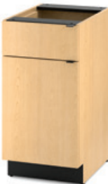
Single Base Cabinet - 18"W 1 Drawer / 1 Door