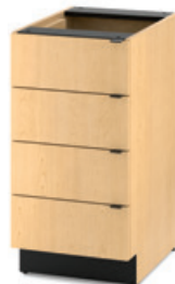
Single Base Cabinet - 18"W 4 Drawers